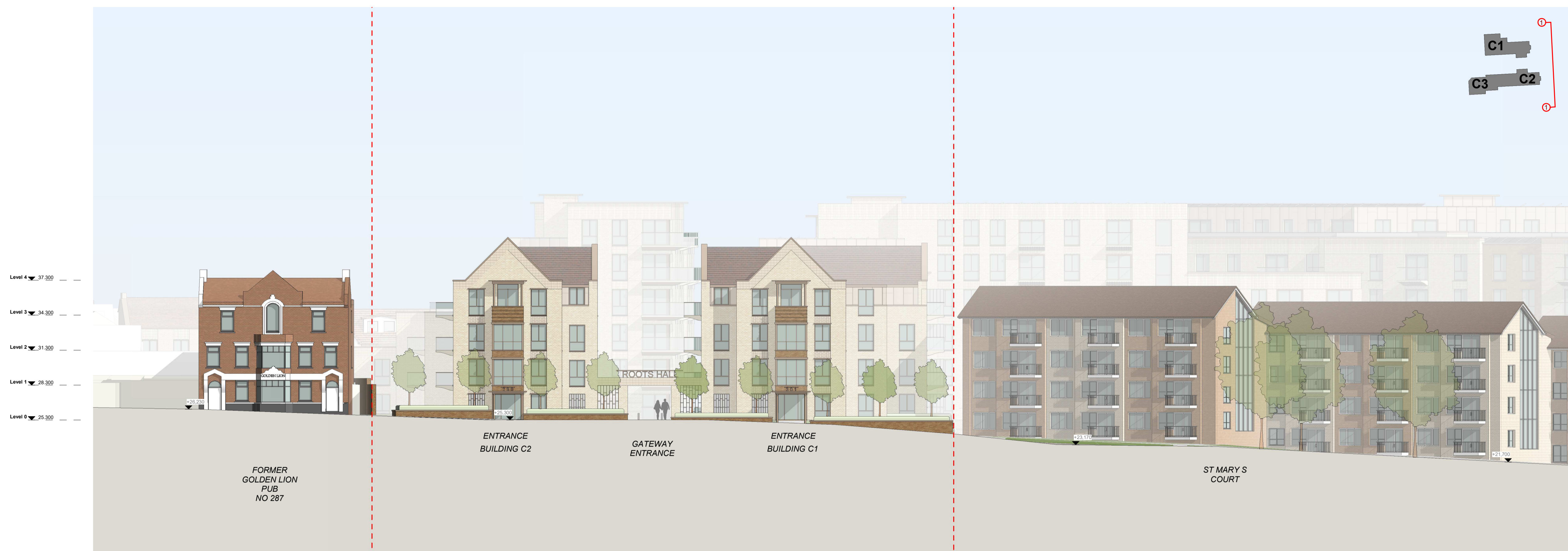
1 East Elevation 1:200