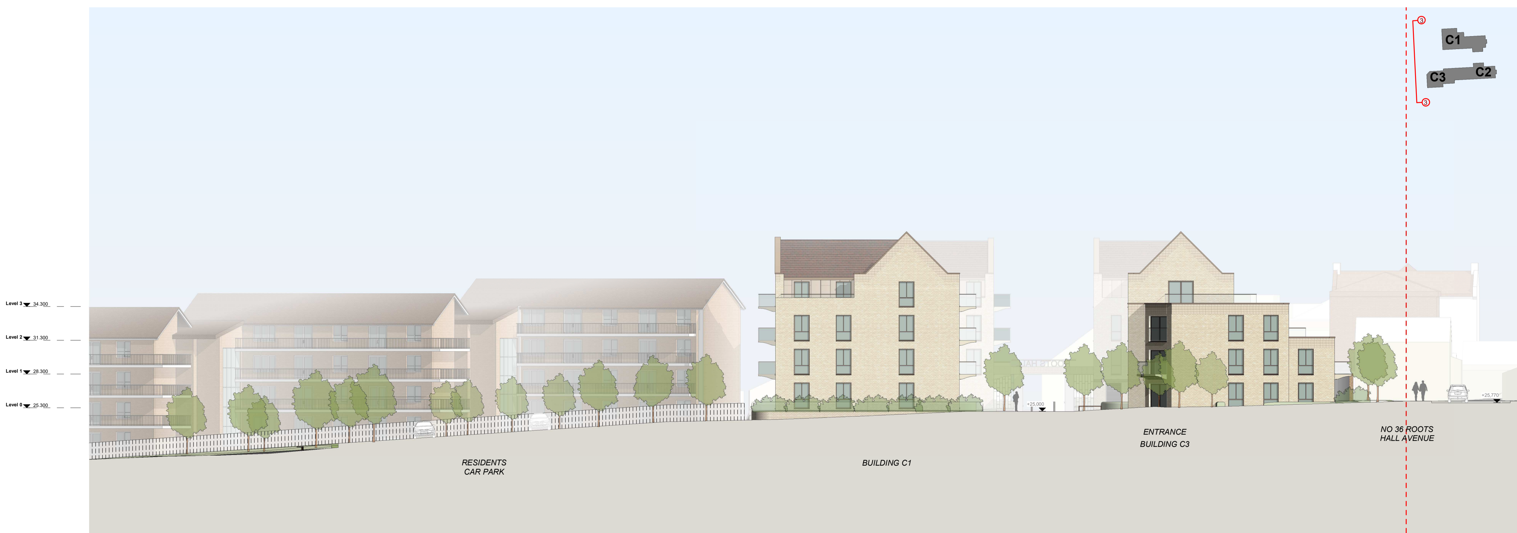
2 West Elevation 1:200

Rev:P03 Date:12.02.2021 Drw:KW Chk:SG Building C Bays and Windows Amended Rev:P02 Date:09.09.2020 Drw:KW Chk:SG Landscape and Parking Amendments; Victoria Avenue Building C Bays, Front Garden Landscape Rev:P01 Date:13.09.2019 Drw:FD Chk:SG Planning Issue